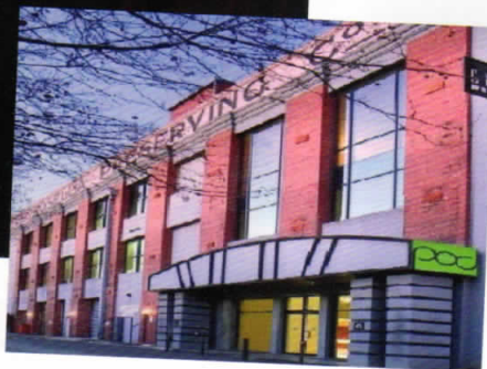
Winning project: Rosella Complex Richmond, winner of the Master Builders Pride in The Job Award 1992.